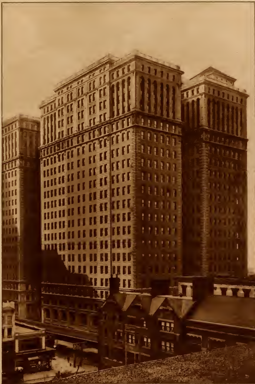
HUDSON TERMINAL BUILDING. Twin structures on Church Street, 22 stories high. In basement is terminal for Hudson tube trains running under North River.